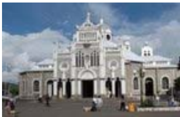
Basilica in Cartago