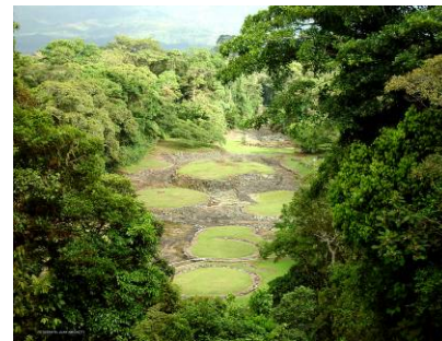
Guayabo National Monument.