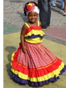
Black Heritage Day Parade