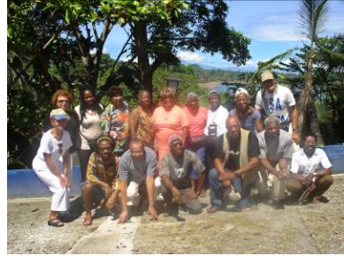
Our Tour Group